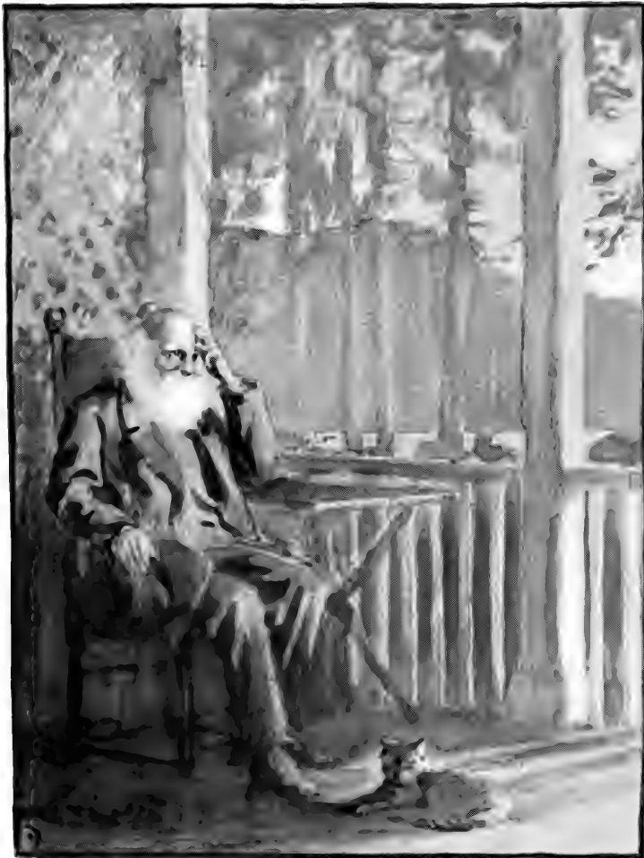
"I SEE HIM AGAIN AT HIS DWELLING."—Page 330.